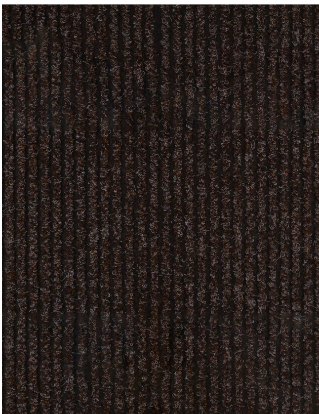
7039 Chocolate 2 m