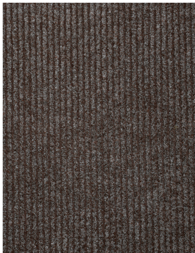
7050 Brown 2 m