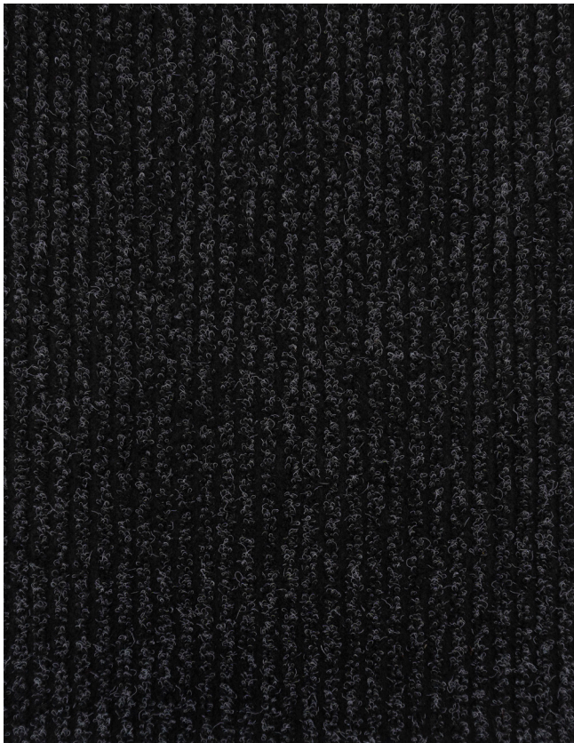
2047 Anthracite 2 m