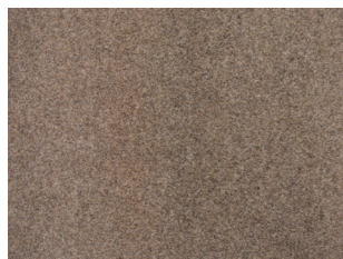
1142 Lichtbeige 4 m