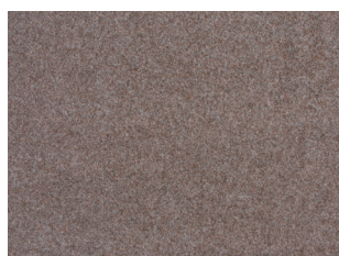
7760 Chevreuil 4 m