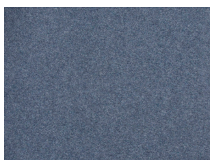
5539 Blauw 4 m