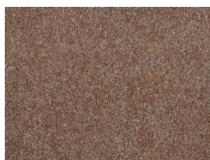
7764 Acorn 4 m