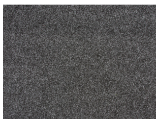
2236 Antraciet 4 m