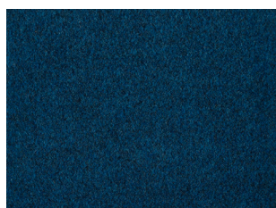
5546 Indi Blue 4 m