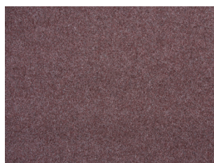
3372 Crushed Berry 4 m