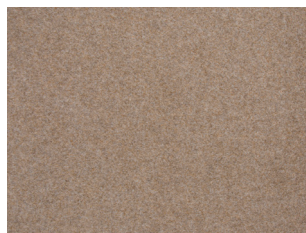
1770 Burro 4 m