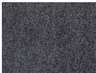
0909 Chennel 4 m