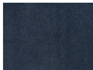
5507 Blauw 4 m