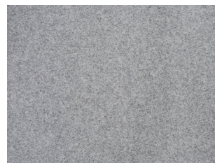
2216 Lichtgrijs 4 m