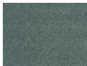
6672 Olive 4 m