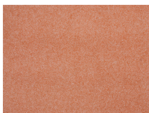
7719 Roest 4 m