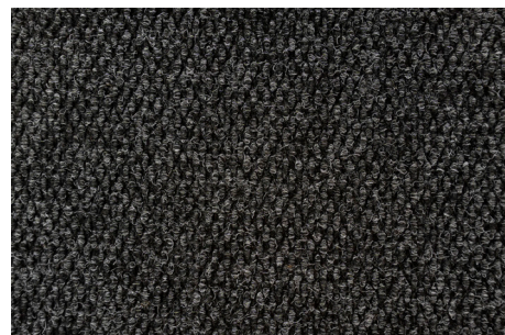
2098 Antra 50 x 50 cm