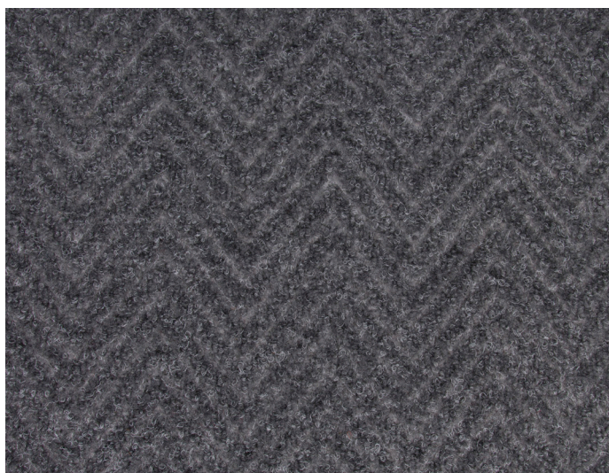
0901 Grijs 2 m