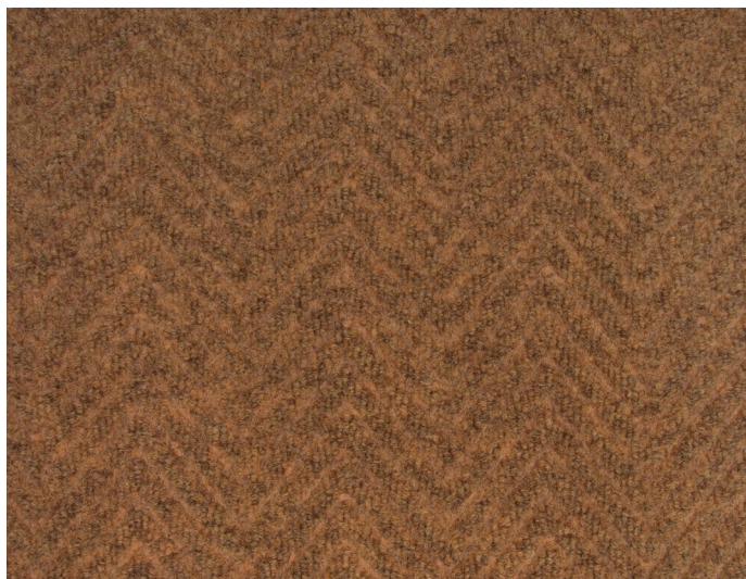
0226 Coir 2 m