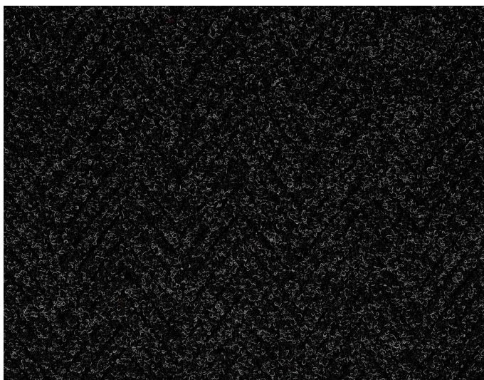
0923 Charcoal 2 m