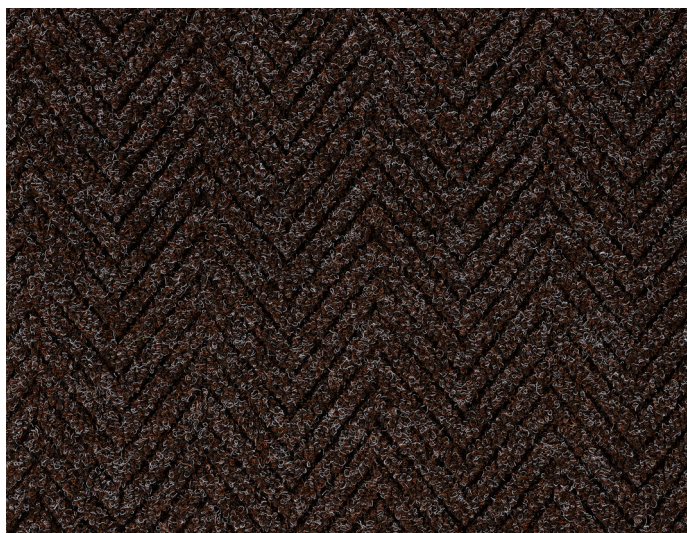
0300 Bruin 2 m