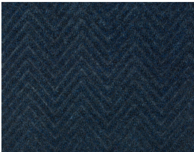
0802 DK.Blauw 2 m