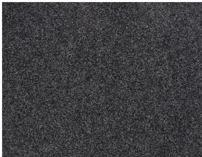
2236 Antraciet 2 m