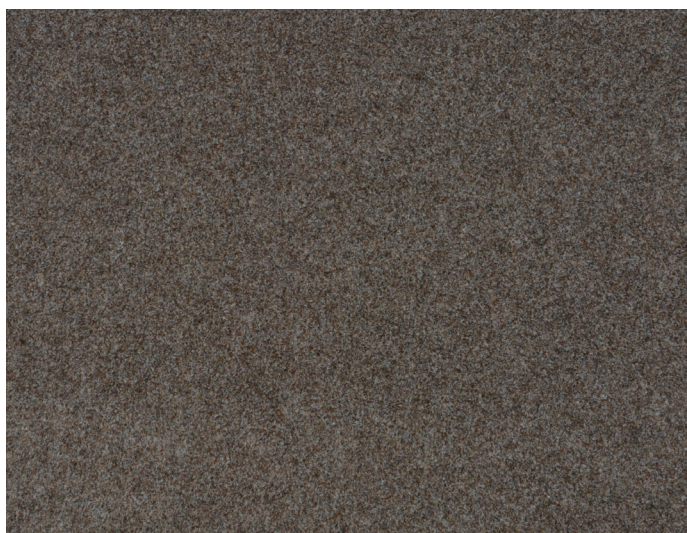
7011 Cacao 2 m