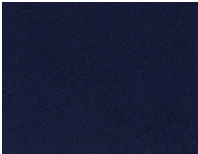
5038 Cobalt 2 m