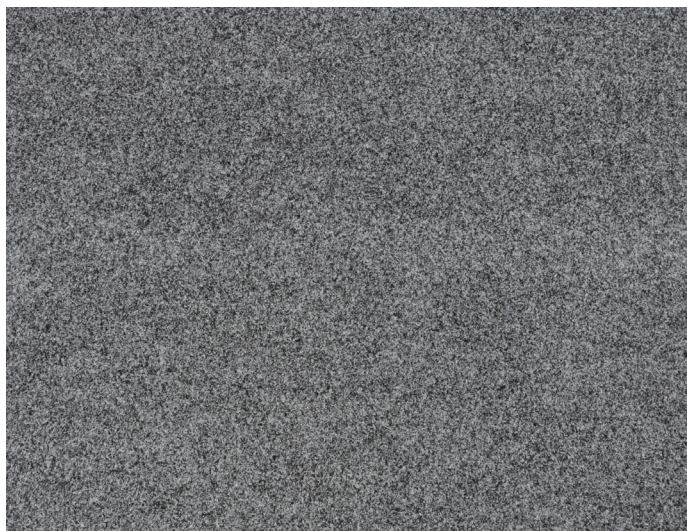
2081 Dark Grey 2 m