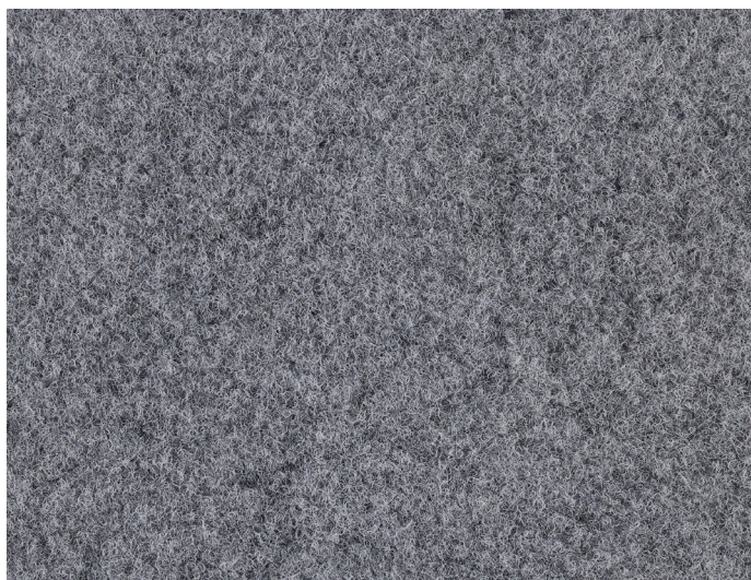
2283 Light Grey 4 m