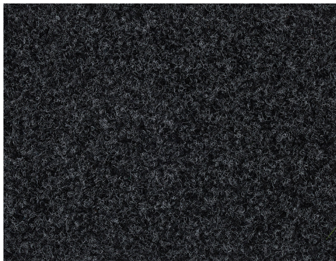
2236 Antraciet 4 m