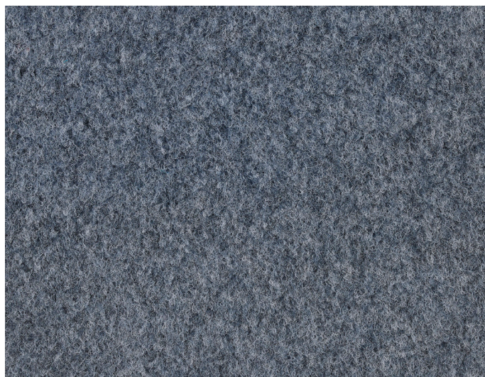
2531 Steel 4 m