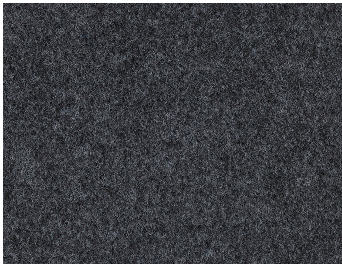
2067 Frost Grey 4 m