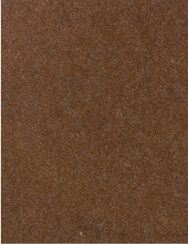
0302 DK.Bruin 1,33 m - 2 m - 4 m