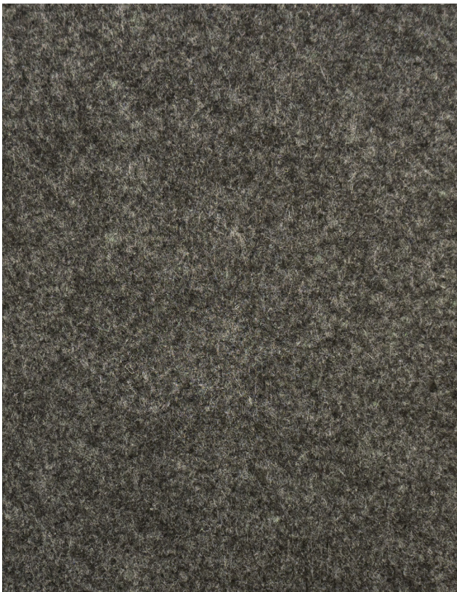
0961 Antraciet 1,33 m - 2 m - 4 m