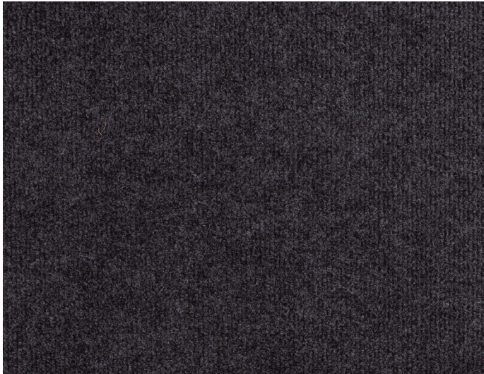
2067 Frost Grey 4 m