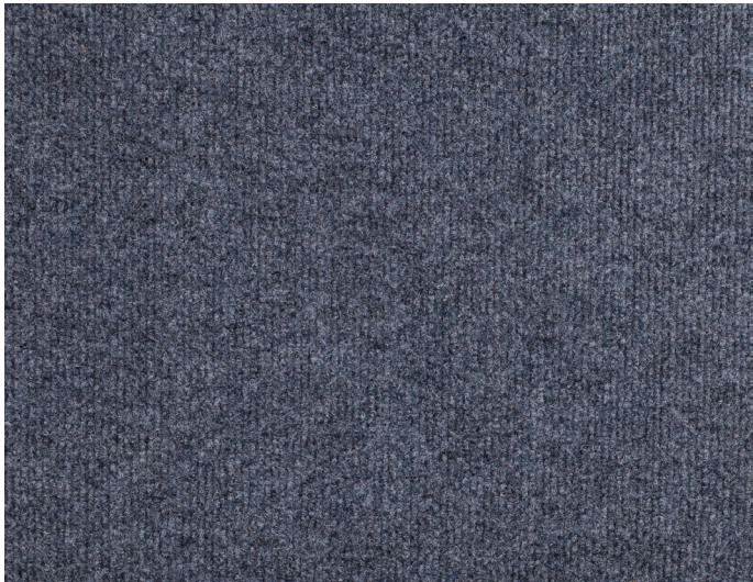
2531 Steel 4 m