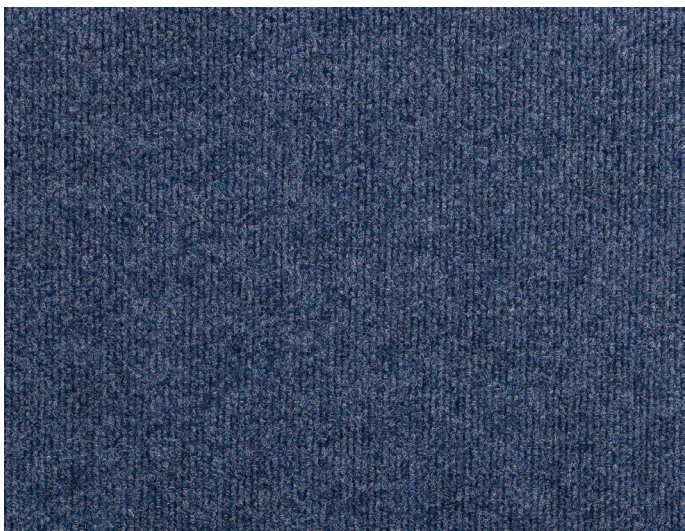
5539 Blauw 4 m