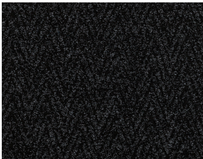
2952 Antracite 2 m