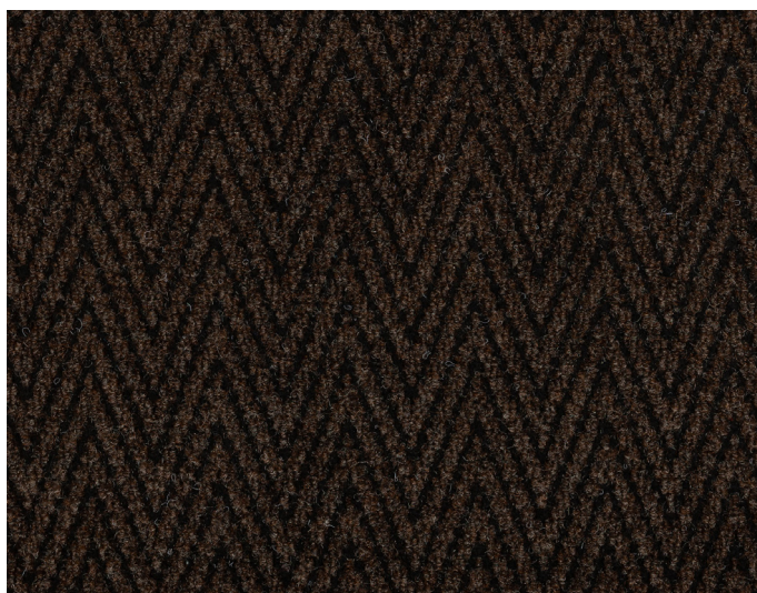
7957 Bruin 2 m