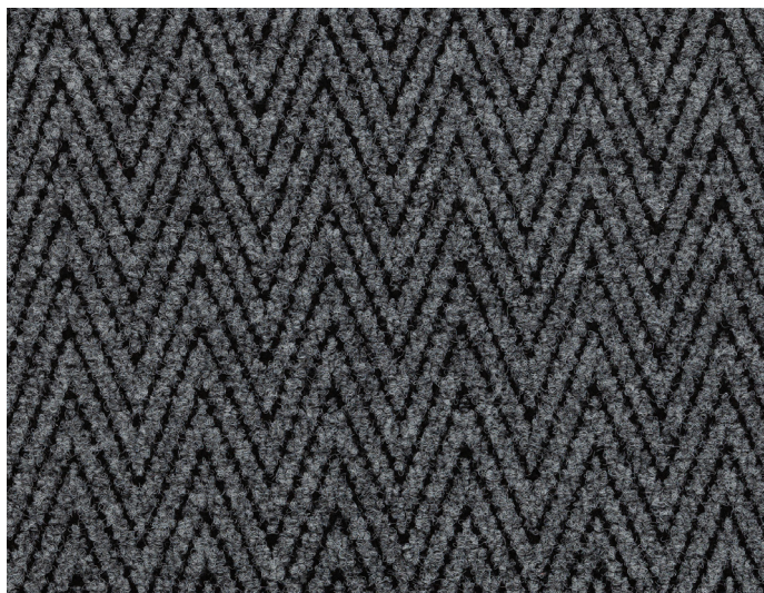
2954 Grijs 2 m