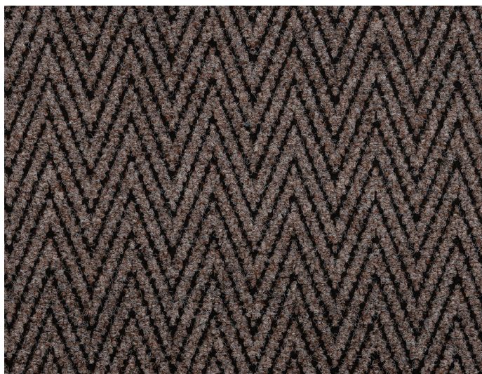
1951 Beige 2 m