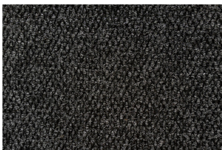
2098 Antracite 2 m - 4 m