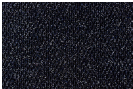
5154 Crown Blue 2 m