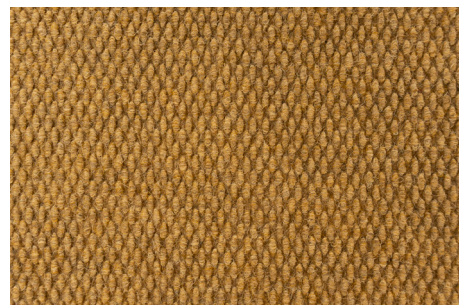
1199 Kokos 2 m