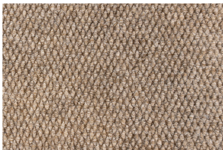
1153 Beige 2 m