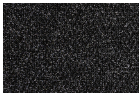
2191 Charcoal 2 m