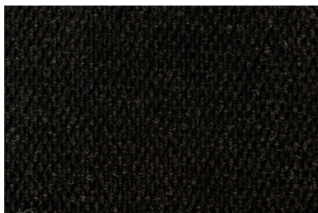
2343 Jet Black 2 m - 4 m