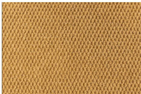
1099 Sisal 2 m