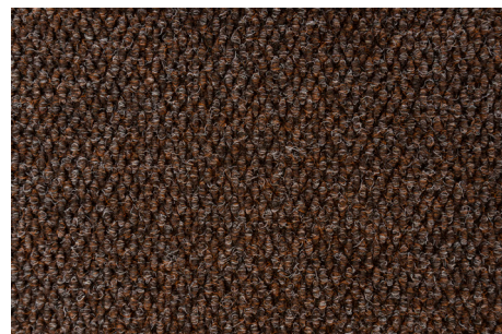
7097 Tabacco 2 m