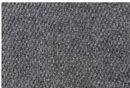
2531 Steel 2 m