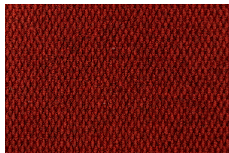
3353 Rood 2 m