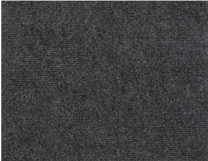
2067 Frost Grey 50 x 50 cm