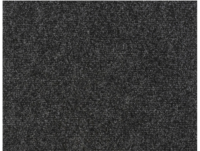
2236 Antra 50 x 50 cm