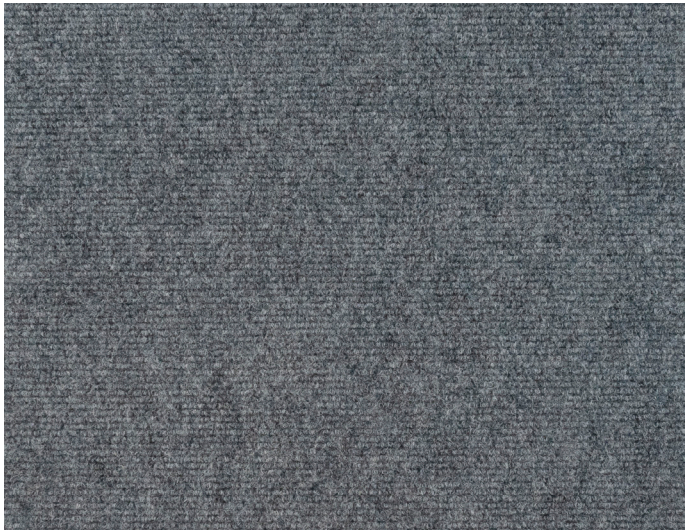
2531 Steel 50 x 50 cm