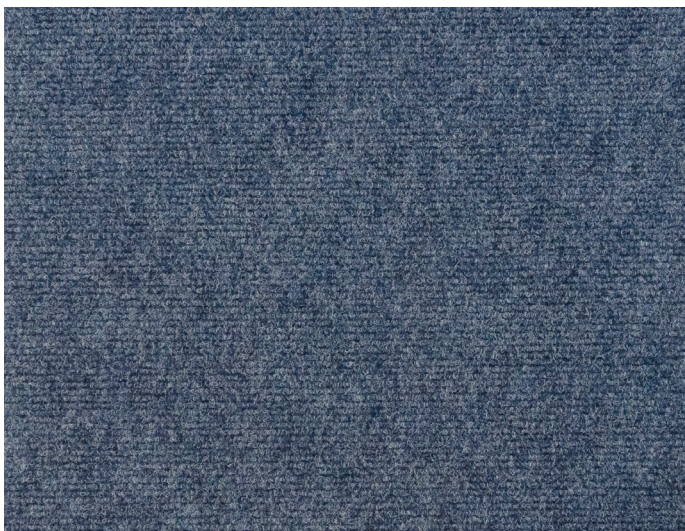
5539 Blue 50 x 50 cm